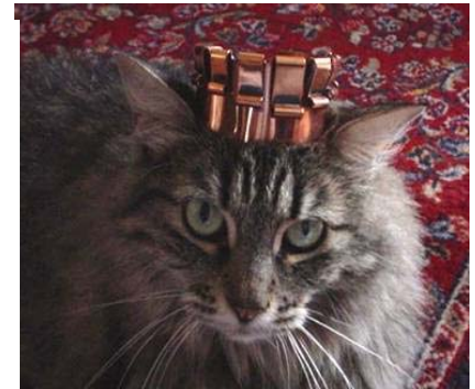
Mattie, the Miracle Cat, with the crown Dad made