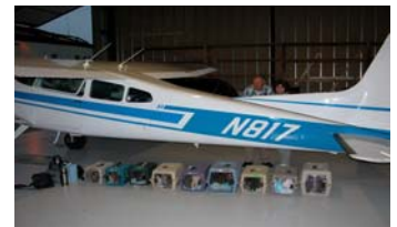
Scott, Sandy and some of the rescued kitties get ready to fly to Arizona