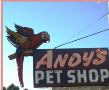
1280 The Alameda (at Julian) San Jose, (408) 297-0840

- lets us show kitties in its adoption center every other month. This store also has really neat "stuff" for kitties.