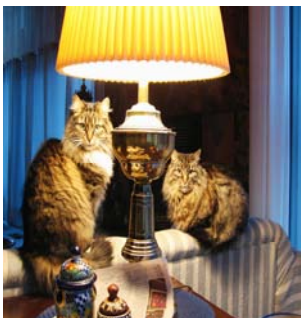
Cufie & Rosie